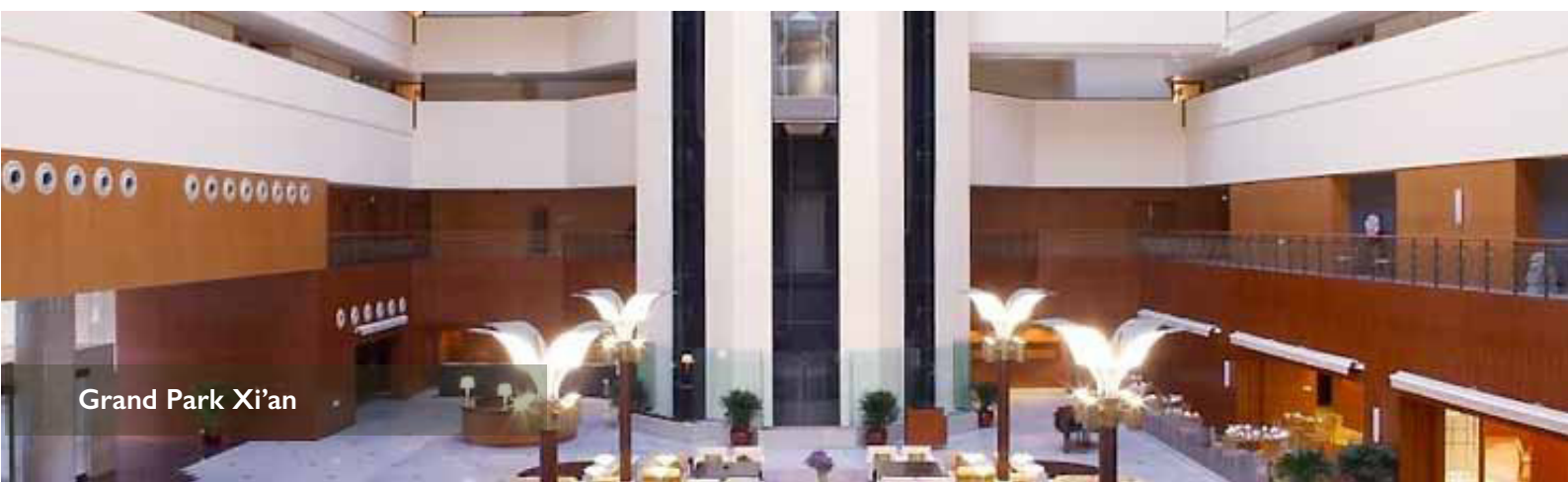
Grand Park Xi'an

Just a 15-minute walk away from some of the city's hottest attractions, its central location makes it perfect for travellers who want to be within easy reach of Xi'an's bustling centre.