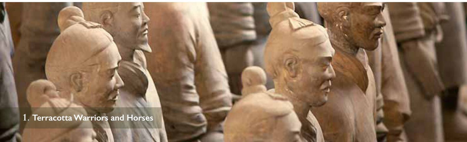
1. Terracotta Warriors and Horses

These guardians offer some of the greatest insights we have into the world of ancient China, but the discovery of this grand spectacle was entirely by chance. Uncovered as recently as 1974, the statues were only found when farmers were digging a well just 1.6 kilometres from the tomb itself. The statues are still studied intensively by international scholars and no trip to the city is complete without taking in this awe-inspiring display of ancient craftsmanship.